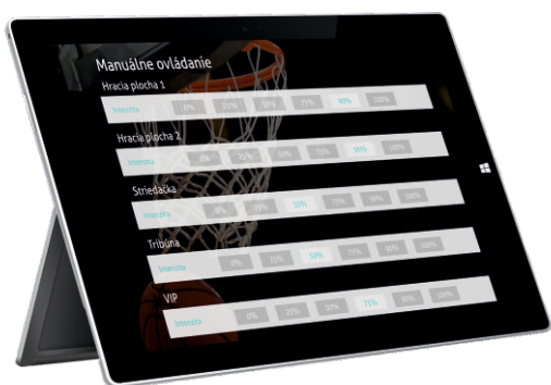
WebUI - App for smart lighting control